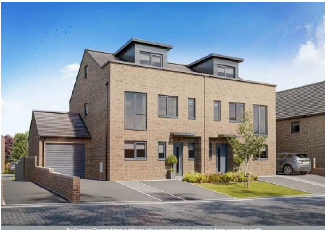
This Computer Generated image is intended only to give an impression of the house design. It is not plot specific.