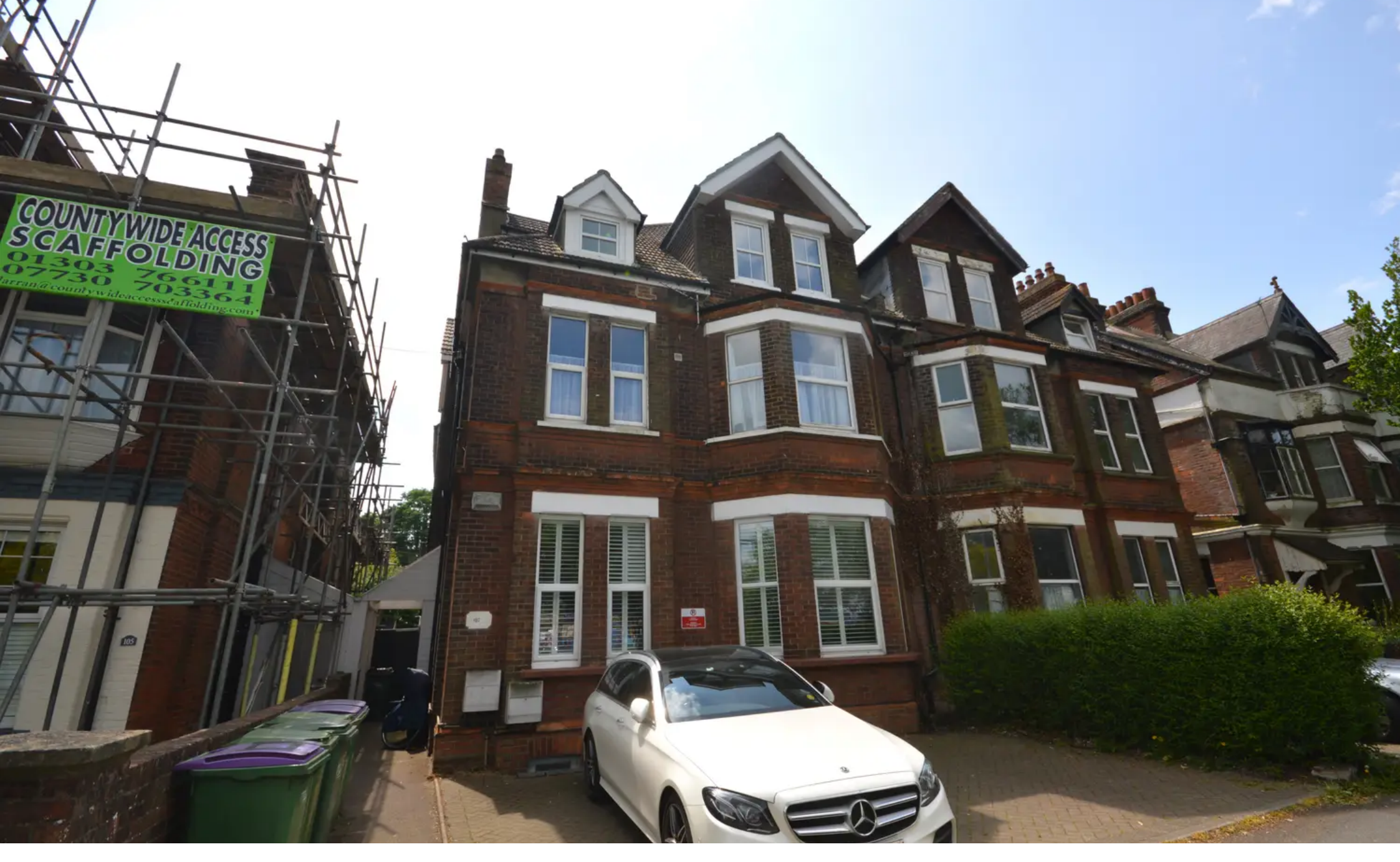
Flat C, 107 Cheriton Road, Folkestone Offers in Region of £220,000