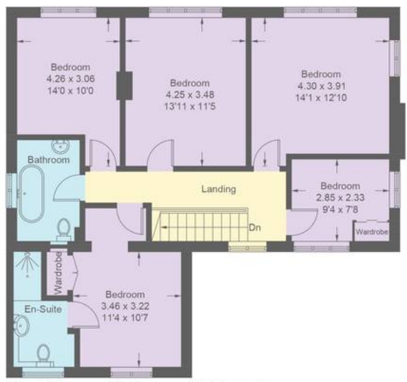
First Floor - 85.4 sq m / 919 sq ft

Approximate Gross Internal Area = 262.7 sq m / 2827 sq ft Garage = 28.0 sq m / 301 sq ft Total = 290.7 sq m / 3128 sq ft