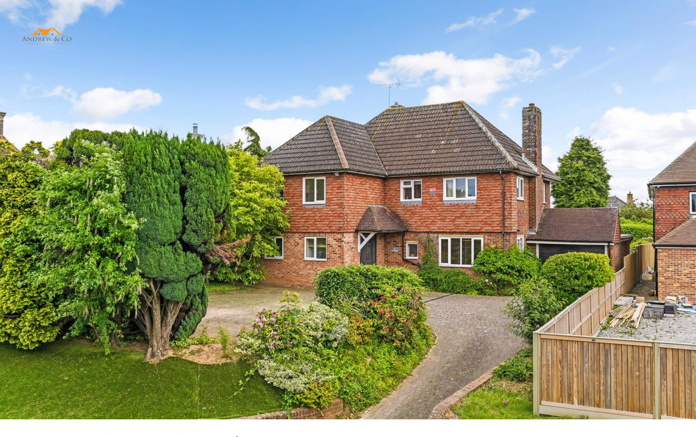
277 Canterbury Road, Kennington