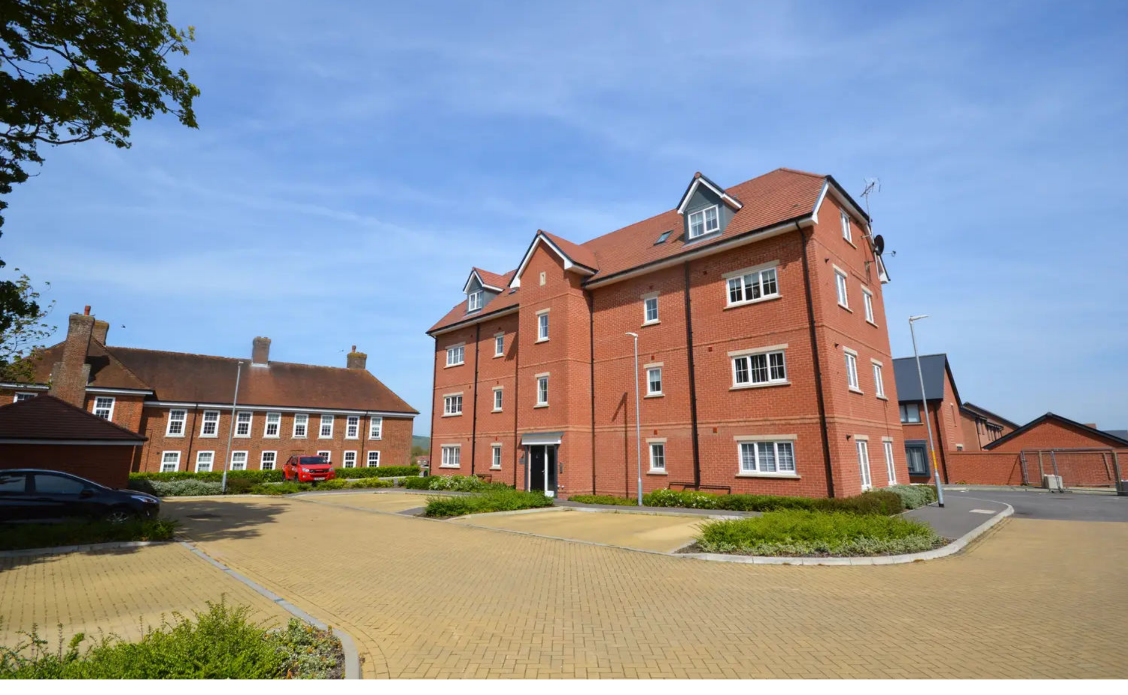
Flat 3, Lieutenant Court, 21 Colonel Drive Guide Price £200,000 - £220,000