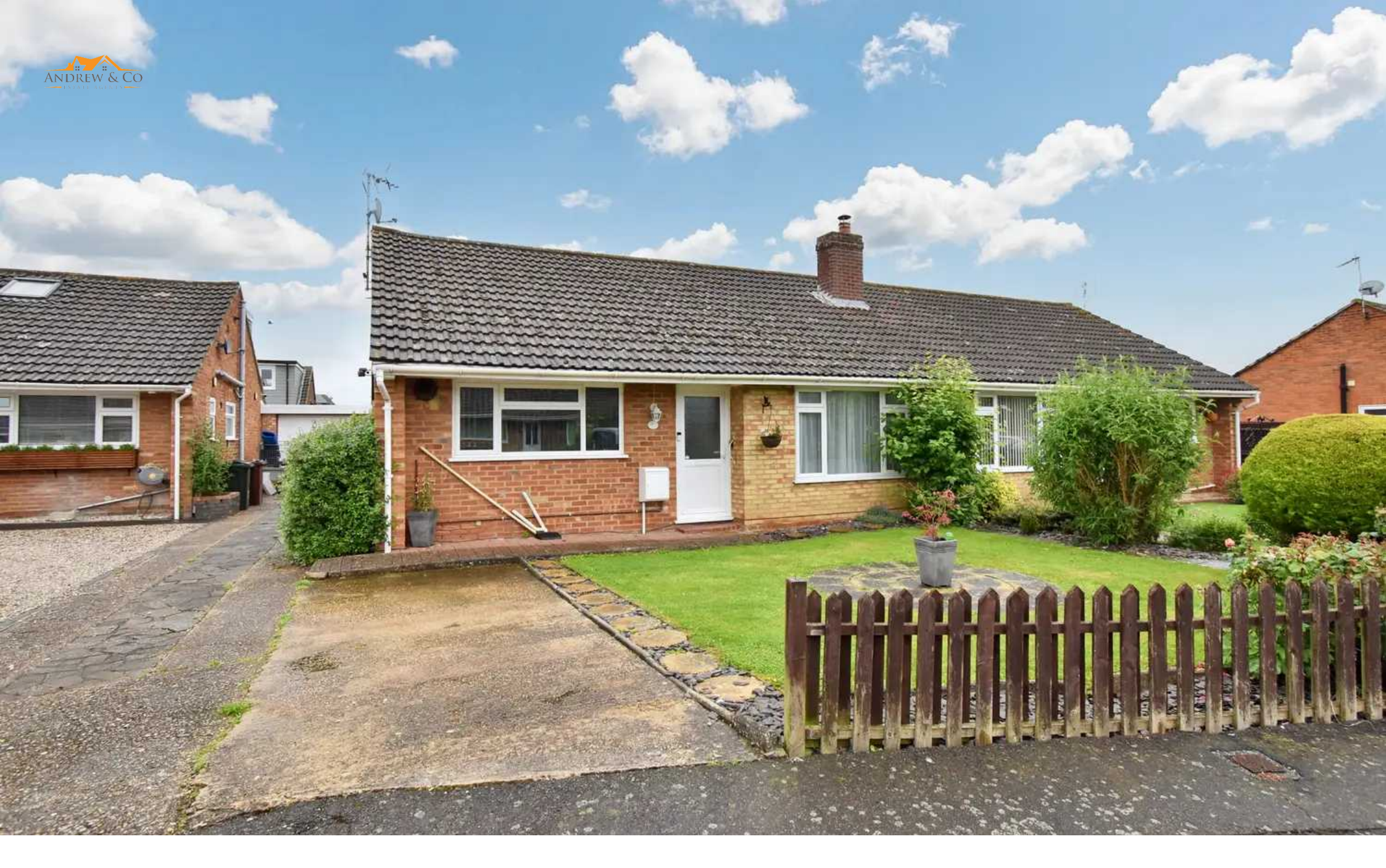
7 Thirlmere, Kennington In Excess of £300,000