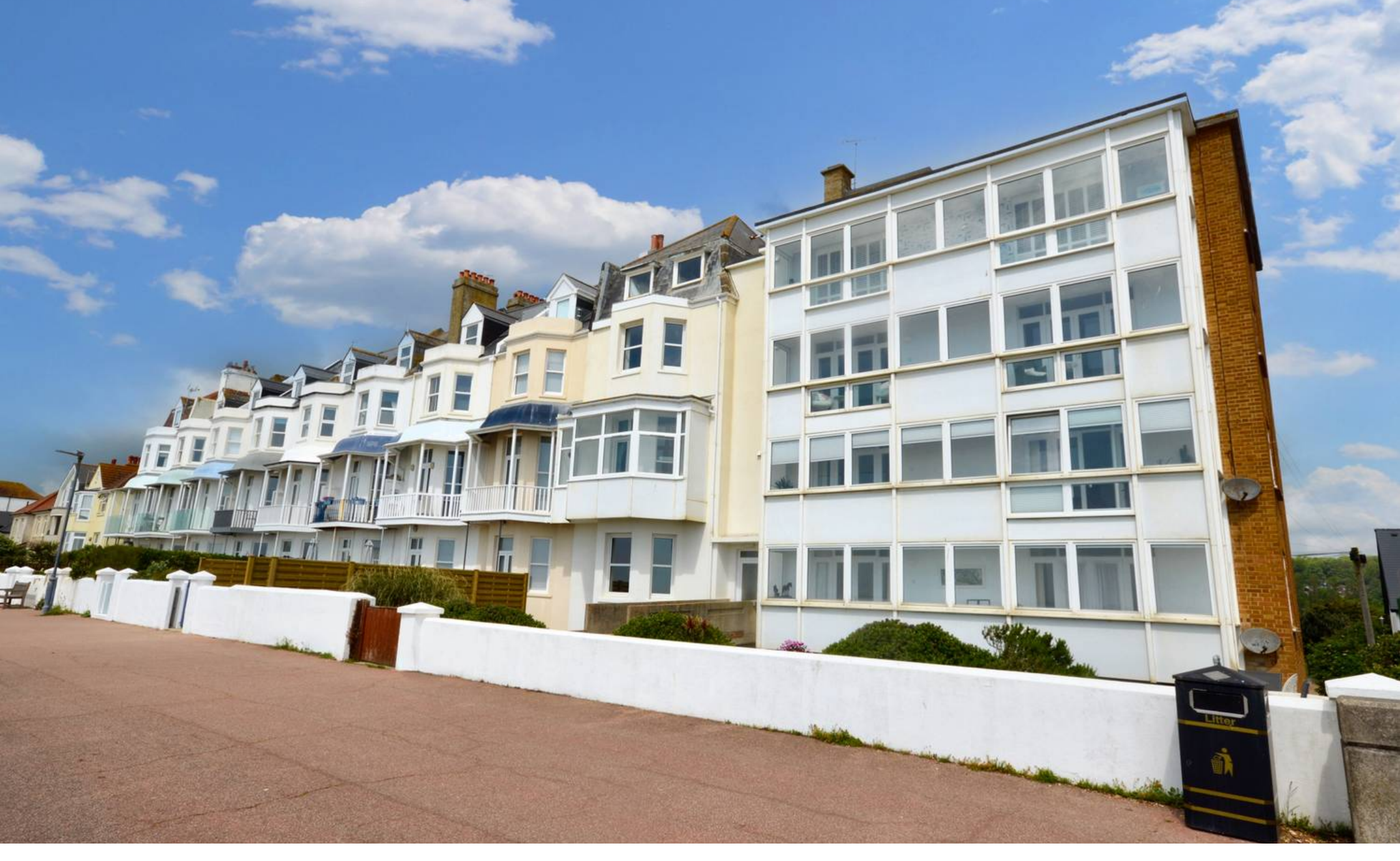
Flat 2, Shipway House, 28 Marine Parade Guide Price £300,000