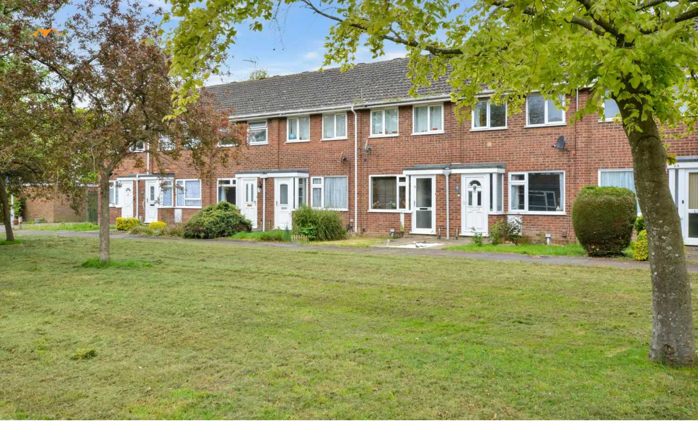
26 East Lodge Road, Ashford £270,000