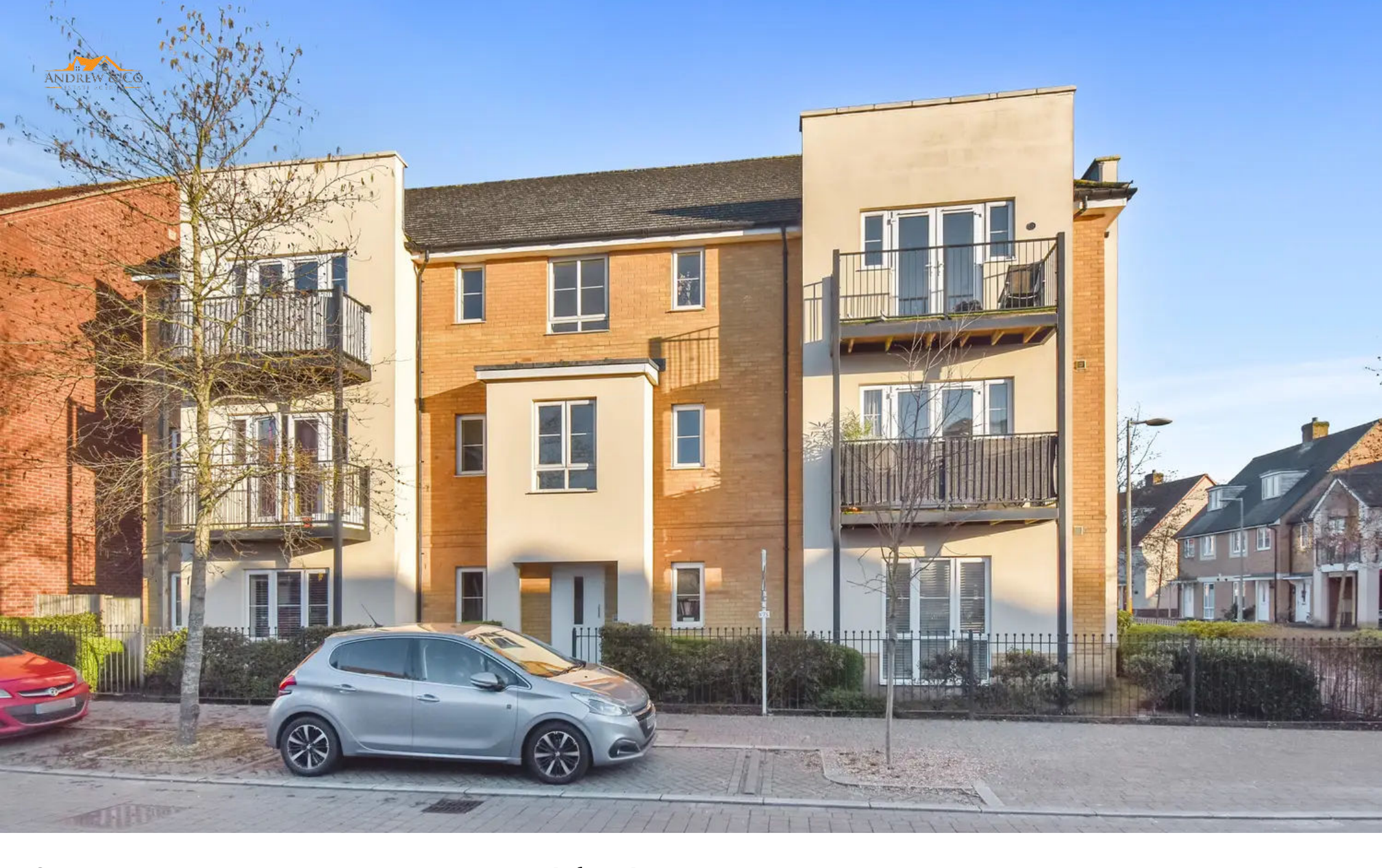
67 Laurens Van Der Post Way, Ashford Offers in Region of £215,000