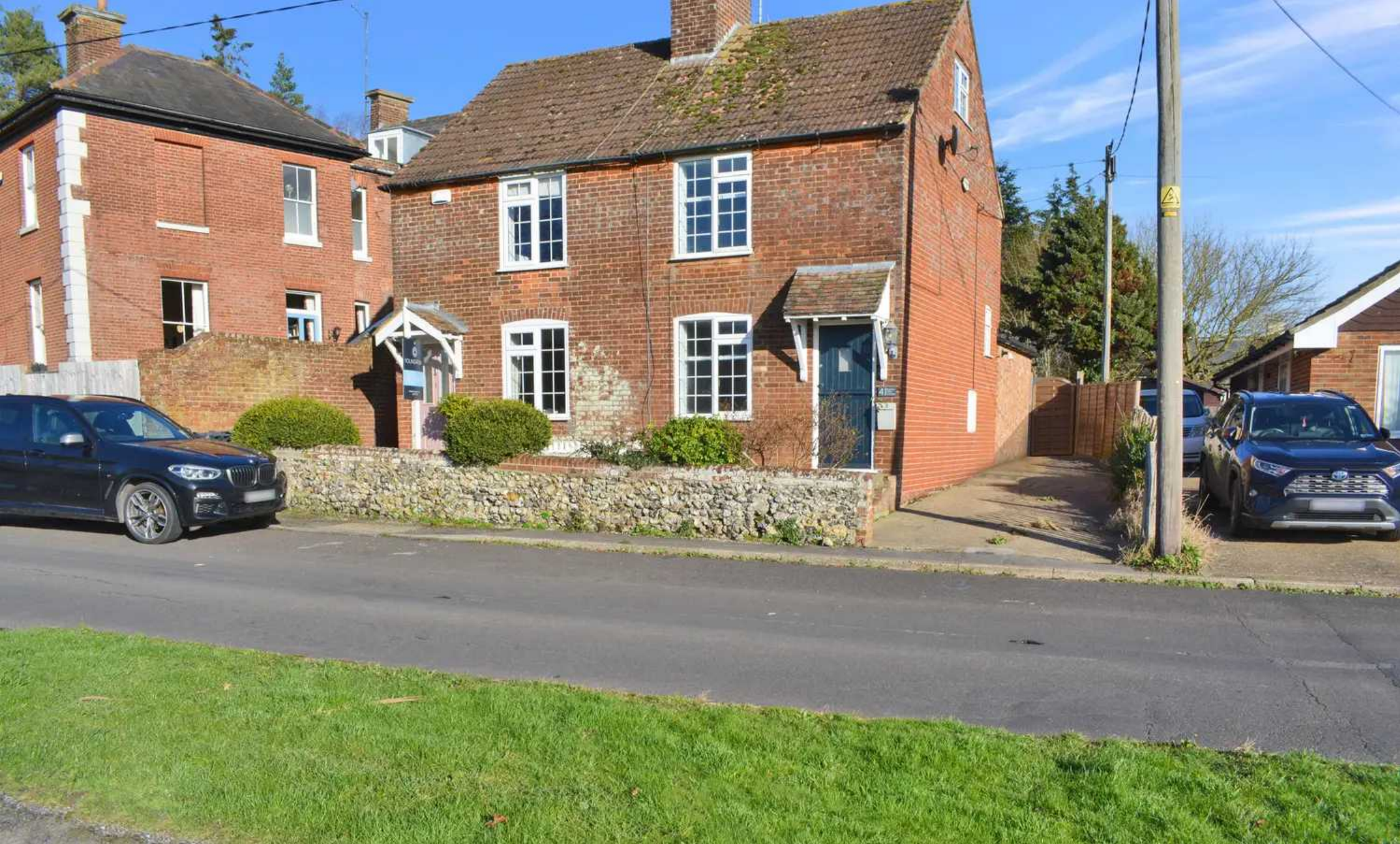
4 Bagham Cross Cottages Bagham Cross, Chilham £375,000