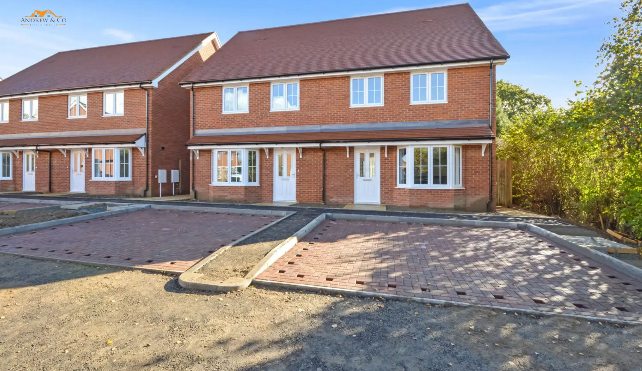
19 Wildflower Grove, High Halden £102,500