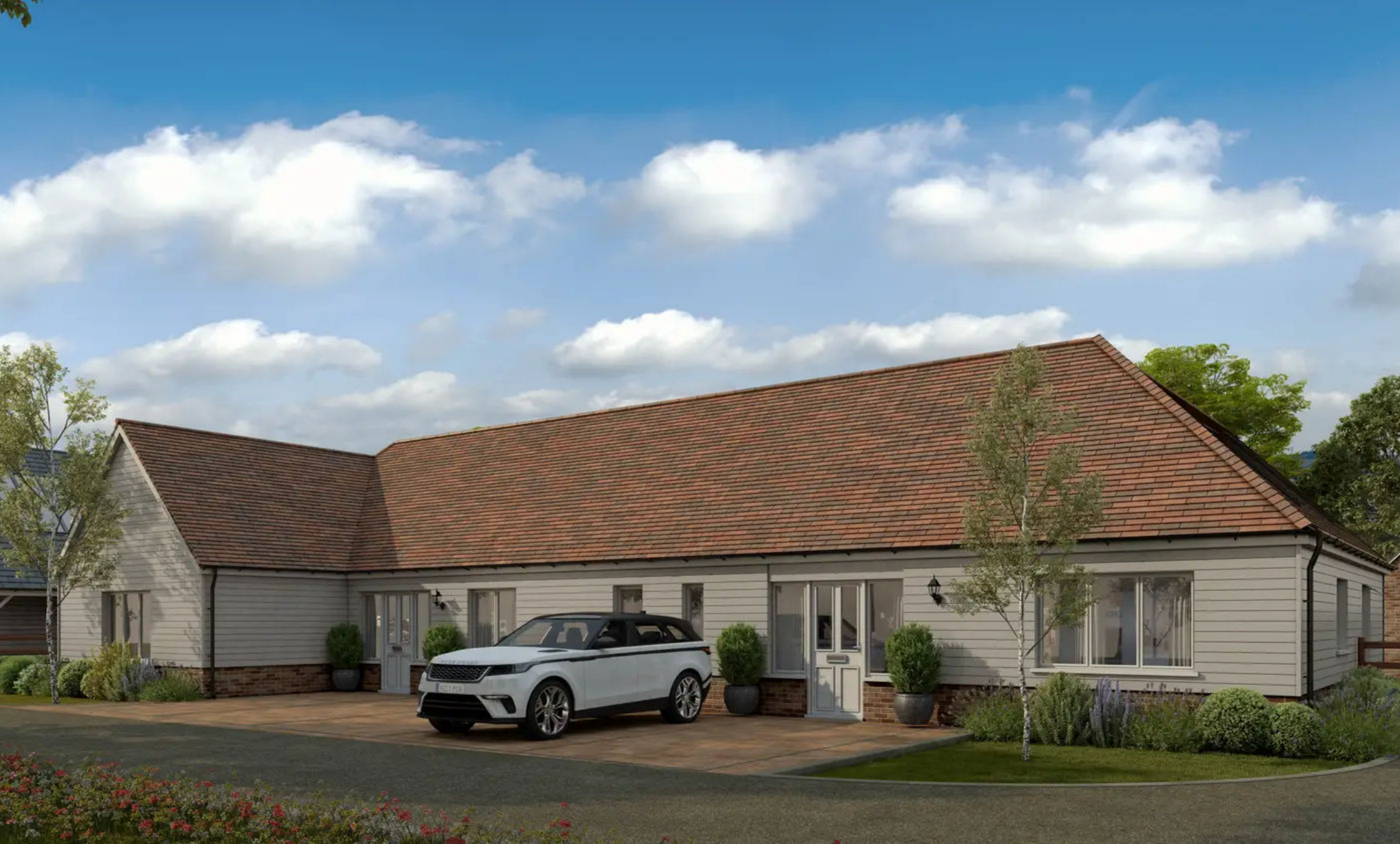
The Old Workshop, Ashford Road, Ashford £550,000