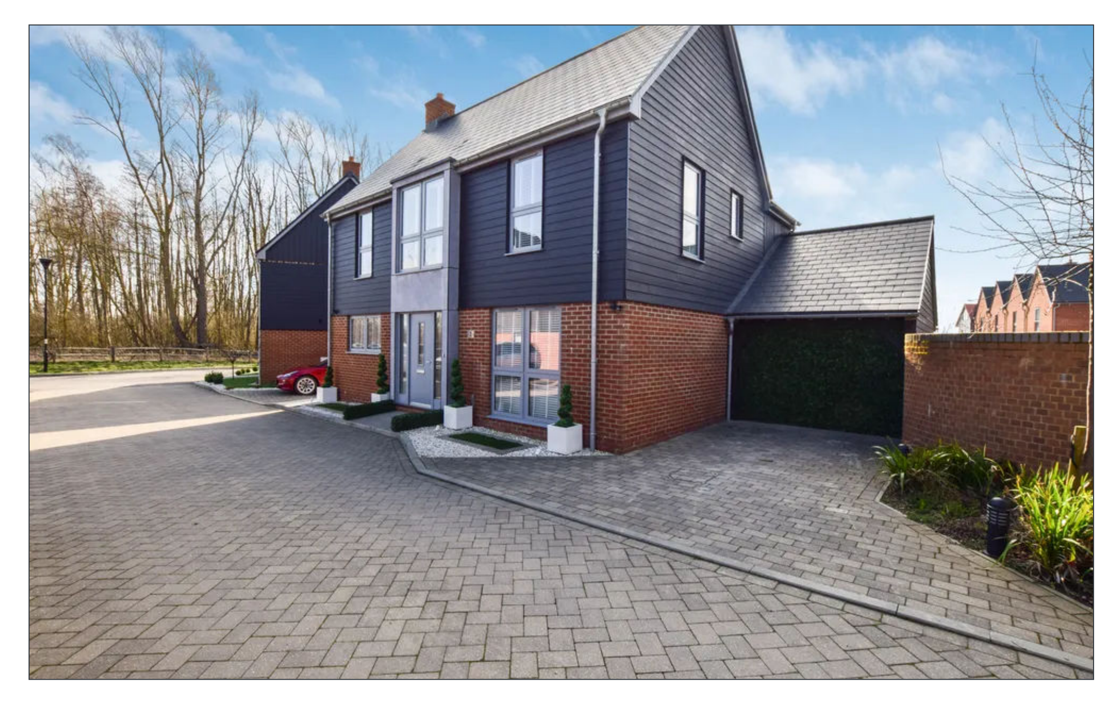
Leveret Lane, Kennington, TN24 £525,000