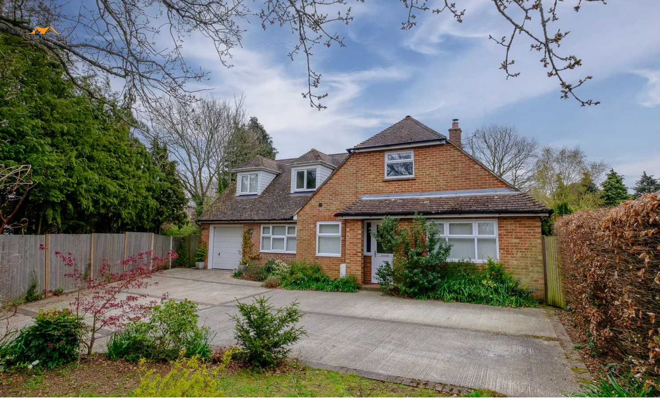
10 Sandyhurst Lane, Ashford £750,000