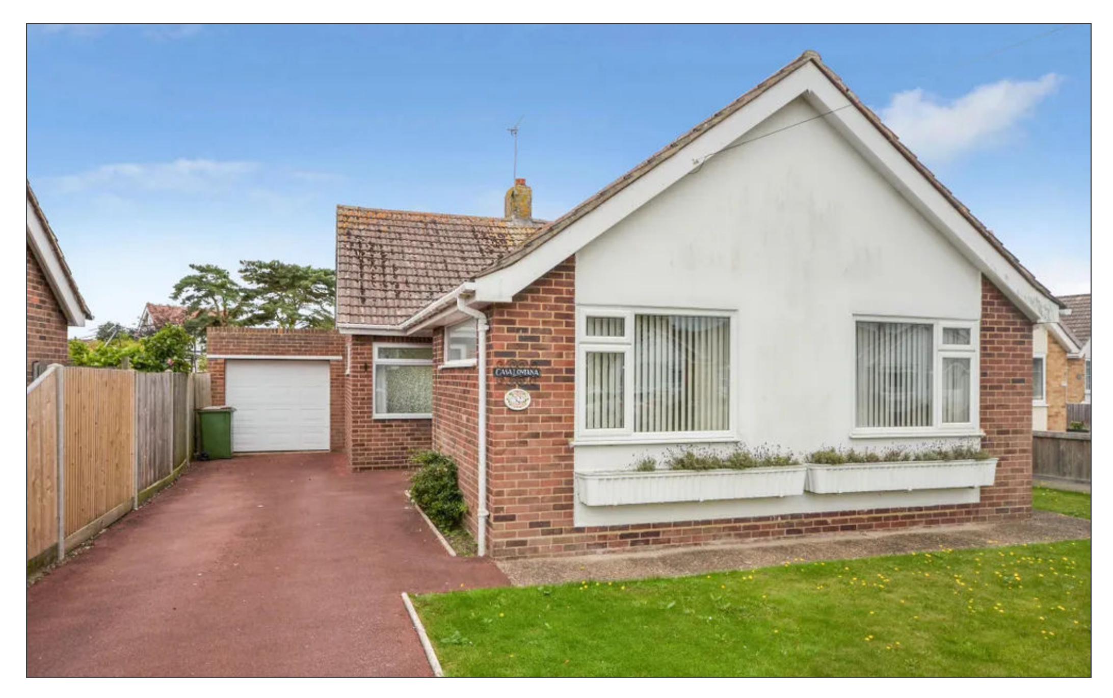
Blenheim Road, Littlestone, TN28 £480,000