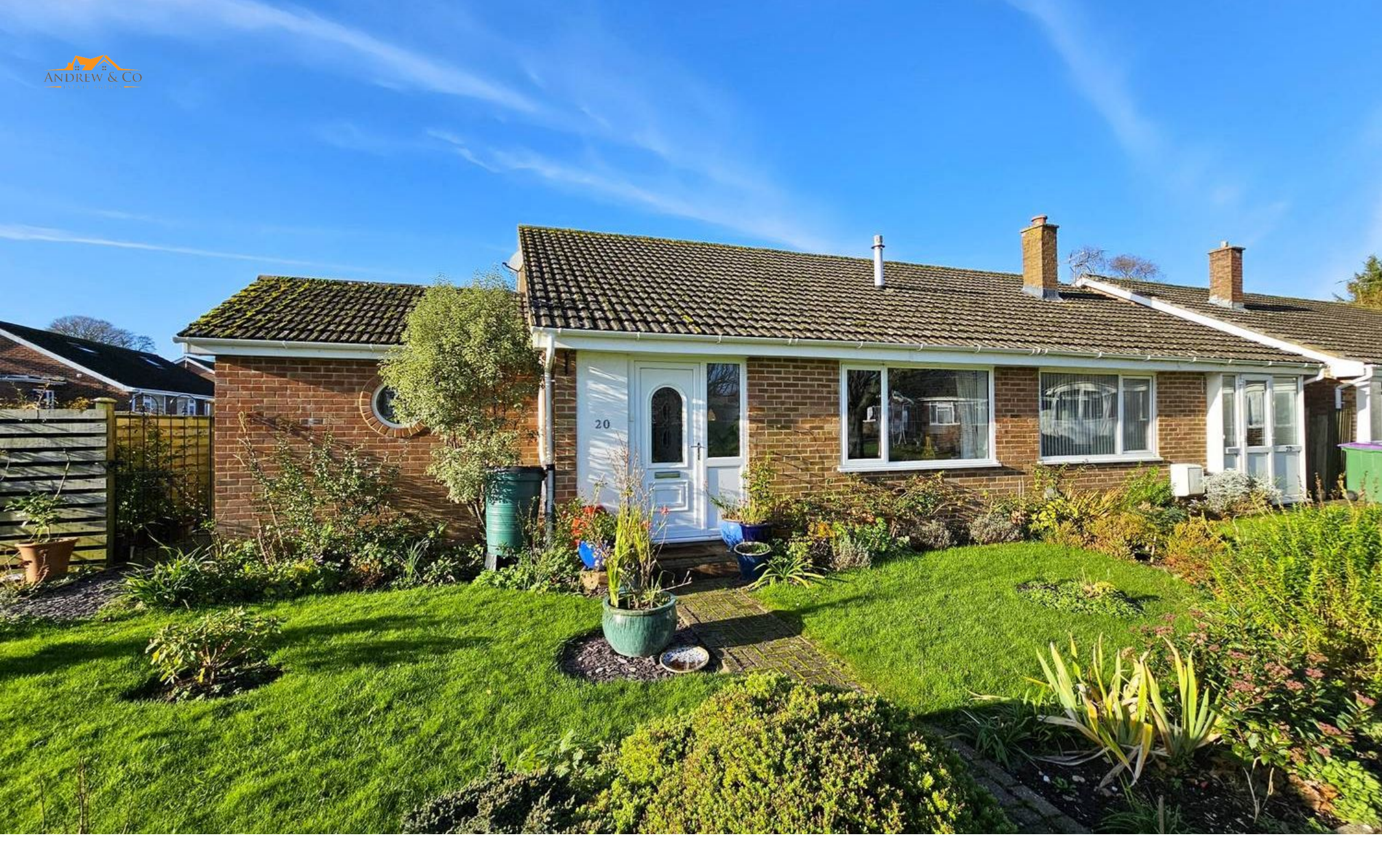
20 Ethelburga Drive, Lyminge