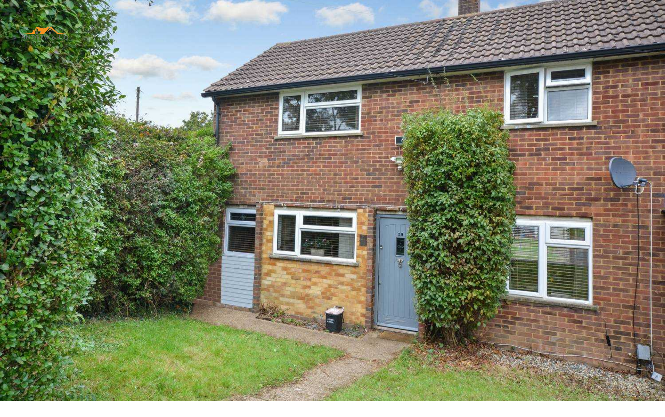
20 Tournay Close, Ashford £250,000