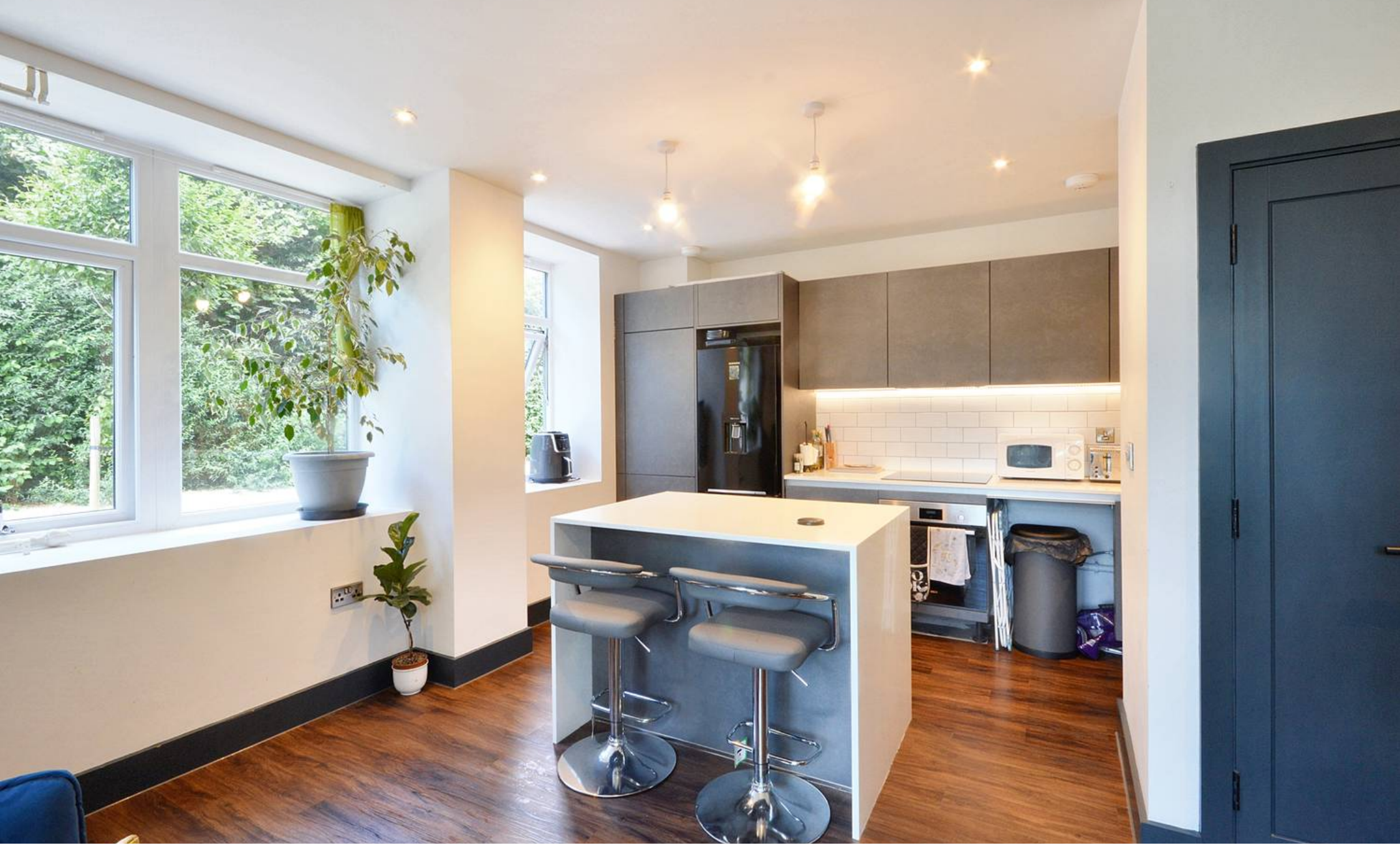
Flat 4, Hawker House Spindle Close, Hawkinge Offers in Region of £200,000