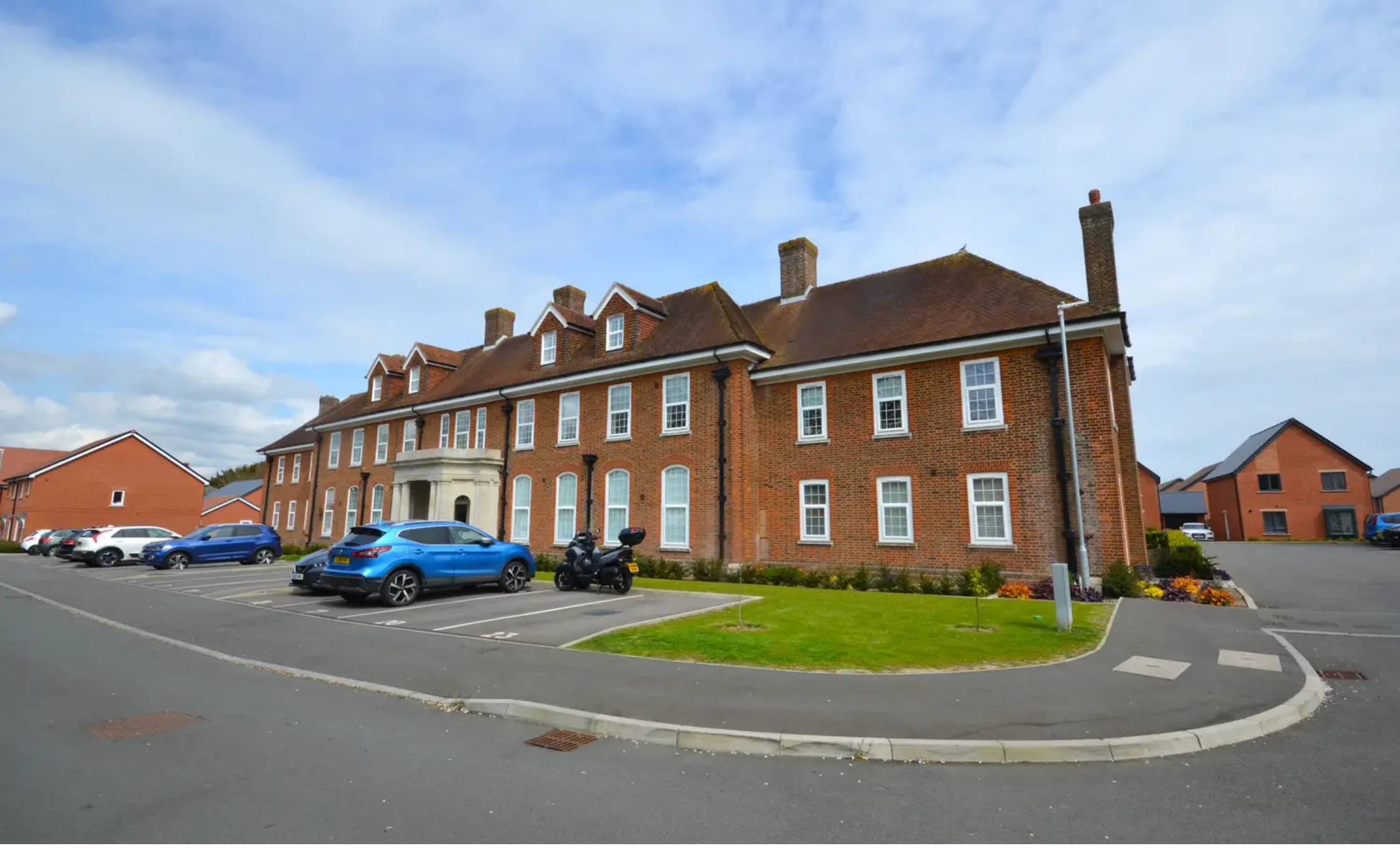
Flat 4, The Old Officers Me