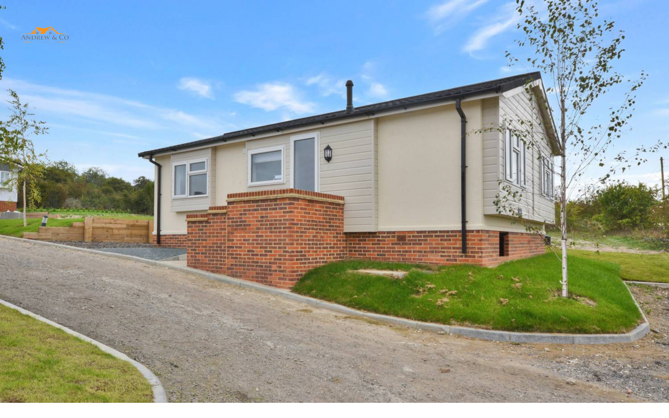
61 Yew Tree Park Home, Charing Offers in Region of £209,000